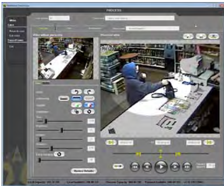
FreezeFrame UHD Software

This software works on any video including surveillance videos from CCTV systems, videos from smart phones, videos from covert cameras, and videos captured from the Internet.